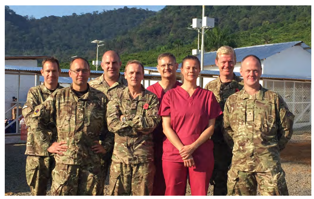
The 22 Field Hospital Ebola Working Group

The clinical management of patients with early Ebola virus disease is typically limited to oral rehydration therapy and anti-pyretics. As the disease progresses and fluid and electrolyte losses occur, parenteral fluid and electrolyte replacement is initiated. Placement of a central venous catheter is undertaken early in the clinical course as patients begin to develop gastro-intestinal symptoms in anticipation of rising levels of viraemia as the disease progresses. Whilst placement of a central venous catheter is undoubtedly hazardous to the operator charged with it's placement, the benefits subsequently in being able to not only administer drugs, fluids and electrolytes but to avoid subsequent use of sharps for venepuncture and peripheral vein cannulation, undoubtedly justifies the initial operator risk. This procedure