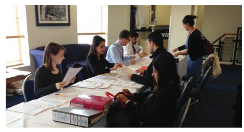
HEE West Midlands staff were on hand throughout the day to ensure that candidates had brought the correct materials to their interview.

Information gathered from our interview debriefing showed that 58% of candidates came with a partner specialty NTN and 42% came directly from core training. The overall pattern of future training intentions shows a pattern consistent with 2013 where 64% intend to undertake a dual programme with anaesthesia, 25% with medicine, 3% with Emergency Medicine and 8% intend to pursue an ICM single CCT.