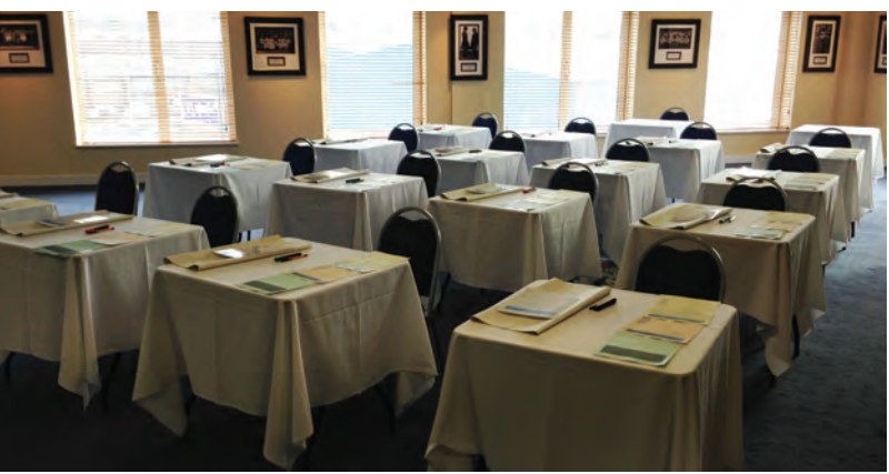
One of the stations used in the interview process. Candidates faced five interview stations in total; three manned stations (with two assessors per station) and two OSCE stations.